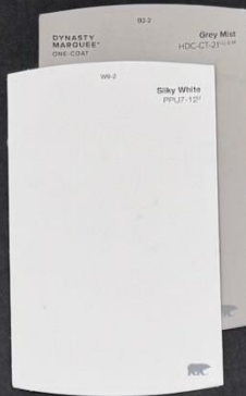
Scheme #201 GM