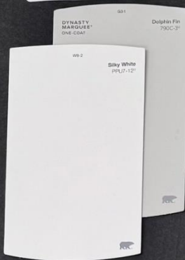
Scheme #201 DF