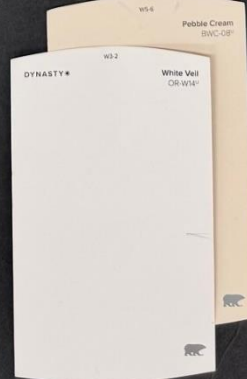
Scheme #213 PC