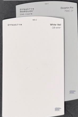
Scheme #213 DF