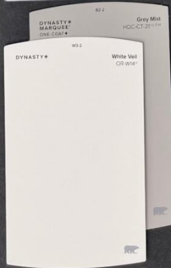
Scheme #213 GM