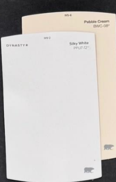
Scheme #201 PC