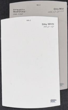
Scheme #201 GM