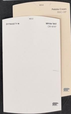
Scheme #213 PC