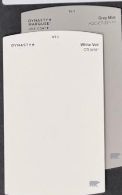
Scheme #213 GM