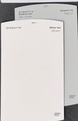
Scheme #213 DF