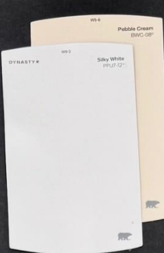
Scheme #201 PC