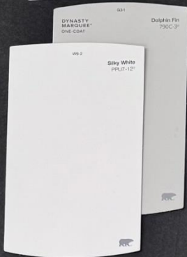
Scheme #201 DF